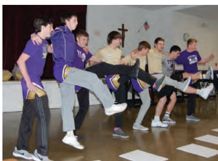
Members of the boys basketball team lead a pep rally in honor of our State Bound Cheerleaders.