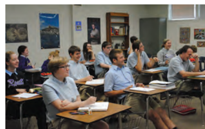
Students listen intently in one of our dual-credit courses, College Algebra.