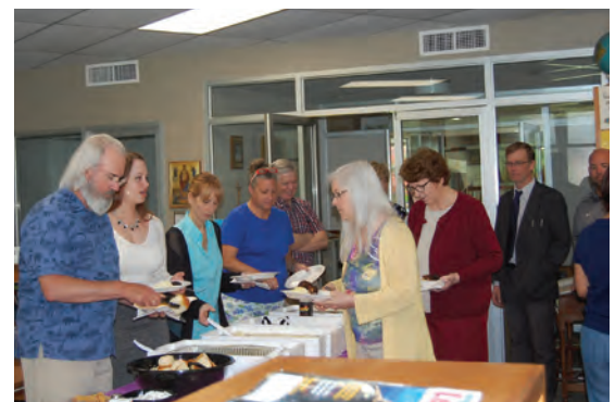
Members of the Routt Faculty and Staff enjoy a luncheon to celebrate the end of the school year.