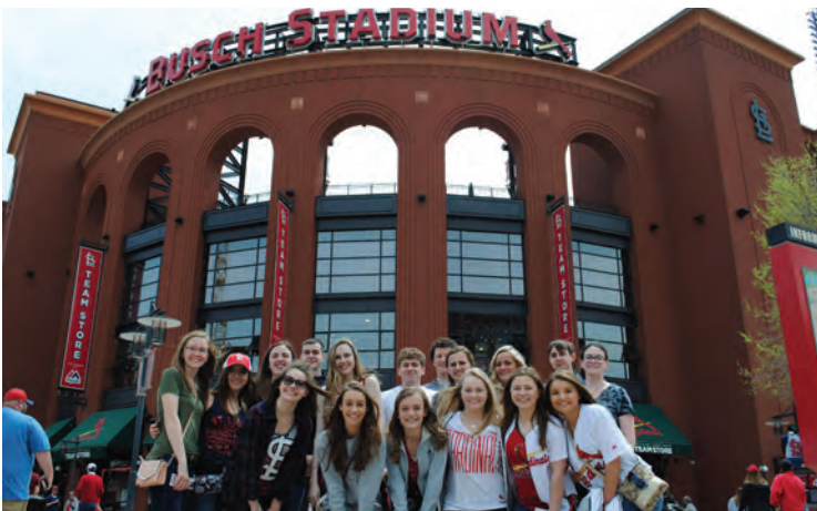
Members of the Class of 2018 gather in front of Busch Stadium during their Senior Trip.

To be listed as a member of the 1902 Legacy Circle, please notify the Development Office that you have included Routt in your estate planning. To name Routt in your Will, designate it to Routt Catholic High School in Jacksonville, Illinois or Routt High School Education Foundation in Jacksonville, Illinois.