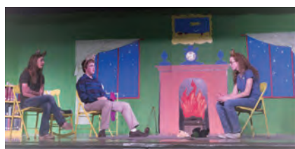
Scene from "I Hate Goodnight Moon" performed by the Theatre Class.