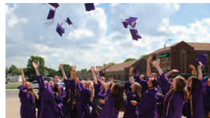
The Class of 2018 participates in the traditional "throwing of the caps" following graduation.

Follow us on social media! Facebook: facebook.com/RouttCatholicHighSchool Twitter: twitter.com/RouttCatholic Instagram: Instagram.com/RouttAlumni YouTube: Search for Routt Catholic High School for our channel! #WeAreRouttCatholic