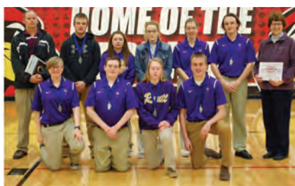
The 2017-18 Scholastic Bowl team were Sectional Champions.