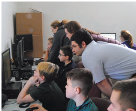
Students at Routt Catholic had the opportunity to collaborate with students of Our Saviour School to talk about the importance of technology.