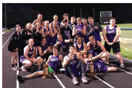
Routt Track - WIVC Champions