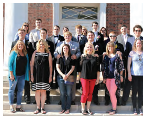
A group of senior boys join their mothers on the steps of Annie Merner Chapel, following the Grand March.