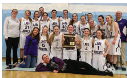
The 2017-18 girls basketball team were WIVC Conference and Regional Champions.