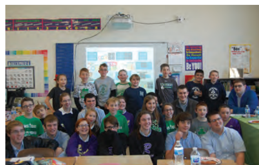
Students from Routt Catholic and Our Saviour School got together to talk about the world of computers, including the benefits of knowing how to write code.