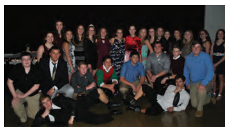
Members of the girls and boys swim teams pose at the Winter Formal.